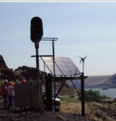
RR Intermediate Signal Installation 720 Watt Solar Array / Wind Hybrid Generator Back-up Southern Washington State

Kyocera Solar, Inc. offers comprehensive dealer support packages including customized engineering, proactive service and sales support, extensive training and a variety of field services.