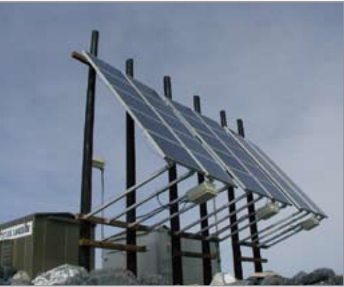
Control Point 2400 Watt Solar Array 15 Day Reserve Northern Utah

RAILROAD SOLAR is Kyocera Solar Inc.'s solution to providing solar electric power systems for railroad applications. As a pioneer in solar technology, Kyocera has been actively engaged for the past 30 years in the research and development of solar power, from developing new materials and devices to designing new products and systems.