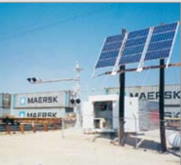
Highway Crossing Installation 1440 Watt Solar Array 400 Watt Wind Hybrid Generator Back-up 15 Day Reserve Southern California