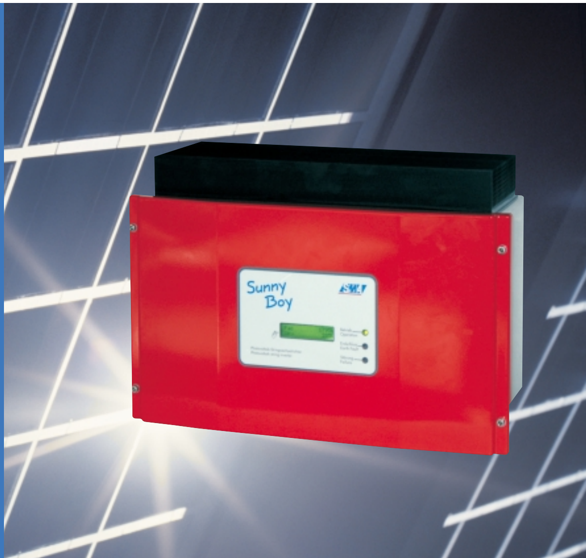
Shown with optional display

The SMA Sunny Boy inverter, the most popular grid-tied photovoltaic inverter in Europe, is now UL 1741 Listed and available in North America. Sunny Boy's extensive track record in some of the world's most demanding markets has made it a favorite among PV professionals everywhere. Over 80,000 Sunny Boy inverters have been installed worldwide. Having achieved the highest reliability of any PV inverter, Sunny Boy gained immediate acceptance in the US and Canadian markets. Superior design, rock-solid German engineering, and exceptional real-world efficiency have made Sunny Boy the top choice for American solar designers. These professionals know that Sunny Boy is a grid-tied inverter that they can recommend without reservation and install with confidence.